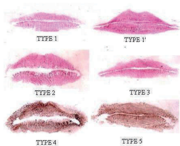
Fig2. Different Lip prints recorded in the given study.