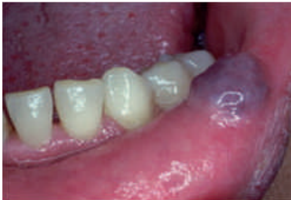
Fig.1.6: Thrombus present on the lower lip

Varices are abnormally dilated veins seen mostly in patients older than sixty years of age. The most common intra oral location is the ventral surface of the tongue where it appears as multiple bluish purple, irregular and soft elevations that blanch on pressure (Fig1.7). If a varix contains a thrombus, it presents as a firm bluish purple nodule that does not blanch on pressure. Thrombi are more common on the lower lip and buccal mucosa (Fig1.6).