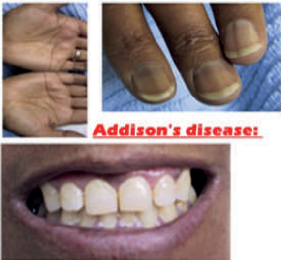
Fig 1.2: Diffuse pigmentation of the gingiva seen in Addison's disease

It is due to progressive bilateral destruction of the adrenal cortex by autoimmune disease, infection or malignancy. Oral involvement presents diffuse brown patches on gingival, buccal mucosa, palate and tongue which may resemble physiological pigmentation (Fig.1.2). Oral mucosal pigmentation associated with Addison's disease develops and progress during adult life and accompanied by weakness, nausea, vomiting, abdominal pain, constipation, weight loss and hypotension. Addison's disease can be fatal if left untreated. Management includes treatment of the underlying cause and corticosteroid replacement therapy.