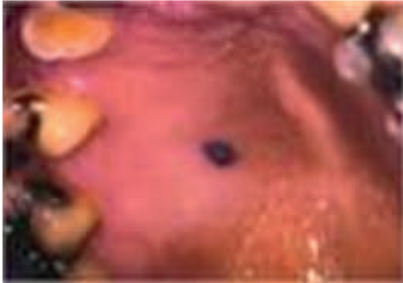
Fig.1.10: Blue nevi present on the palate.

Pigmented nevi are rare causes of focal oral pigmentations. They present either brown or blue lesions (Fig1.10). As such they are classified as Junctional, Intradermal or Intramucosal and Compound nevi. These nevi may represent precursor lesions to oral mucosal melanoma. Thus these lesions should be excised and submitted for histopathologic examination 5 .