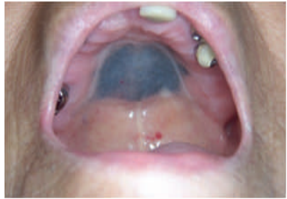
Fig.1.3: Bluish Grey pigmentation of the hard palate caused by antimalarial drug chloroquine.

The pathogenesis of drug-induced pigmentation varies depending on the causative drug. Chloroquine (Fig.1.3) and other quinine derivatives are used in the treatment of malaria, arrhythmia and arthritis. Mucosal discolouration with this drug occurs as blue grey or blue black pigmentation in the hard palate 3 .