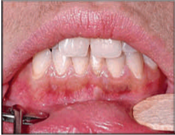
Fig.1.1: Physiologic pigmentation due to increased keratinisation