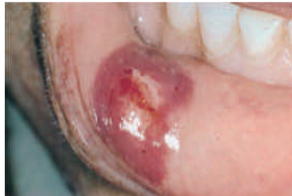
Fig.1.8: Hematoma of the lower lip.

Hematomas, purpuras and ecchymoses are caused by extravasations of blood into the soft tissues. They appear as non blanching flat or elevated pigmented lesions (Fig1.8). They may occur spontaneously in certain systemic conditions such as idiopathic thrombocytopenic purpura or they may result from trauma. The colour produced by the degradation of haemoglobin to bilirubin varies among red, purple, blue and bluish black depending on the length of time. The colour gradually returns to normal, but takes upto two weeks. If hemorrhagic lesions occur in the absence of recent trauma, the patient should be investigated for platelet disorders and coagulopathies.