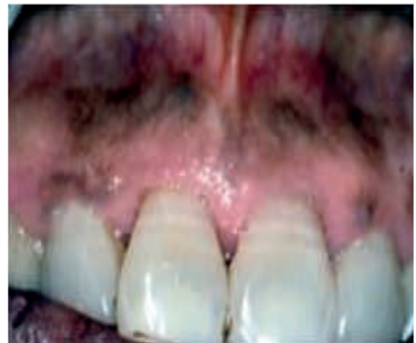
Fig.1.4: Brownish black hyperpigmentation of gingiva in smoker's melanosis.

Smoking may cause oral pigmentation in light skinned individuals and accentuate the pigmentation of dark skinned persons 4 . Smoker's melanosis occurs in up to 25% of the smokers 5 . Women are more commonly affected than men, which suggest a synergistic effect between the female sex hormone and smoking. The brownish black lesions occur mostly on the anterior labial gingiva followed by buccal mucosa (Fig1.4). Smoker's melanosis usually disappears within three years of smoking cessation. Biopsy should be performed if there is surface elevation or increased pigment intensity or the pigmentation is in unexpected site 4 .