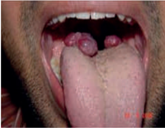
Fig. 1.5: Haemangioma of the tongue