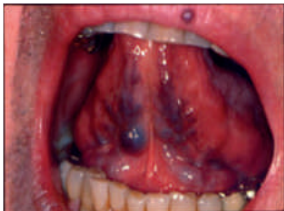
Fig.1.7: Varices present on the dorsum of the tongue.