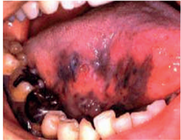
Fig.1.11: Oral melanoma of the tongue.

It is characterised by proliferation of malignant melanocytes along the junction between the epithelial and connective tissues as well as within the connective tissues. The most common site is the palate which occurs in about 40% of the cases followed by gingiva. Clinically, oral melanoma may present as an asymptomatic, slow growing brown or black patch (Fig.1.11) with asymmetric and irregular borders with ulceration, bleeding, pain and bone destruction.