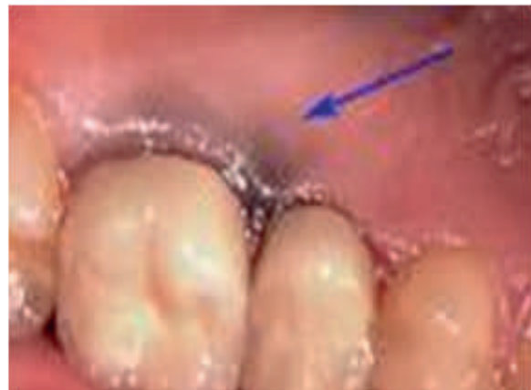
Fig.1.9: Blue grey hyperpigmentation of amalgam.

It is one of the most common causes of intra oral pigmentations. It presents clinically as a localized flat, blue-grey lesions of variable dimensions (Fig1.9). The gingival and alveolar mucosa are the most common sites of involvement. In some cases, when the amalgam particles are large enough, they can be seen in intraoral radiographs as fine radio-opaque granules. In these circumstances the diagnosis of amalgam tattoo can be made on the basis of the clinical and radiographic findings.