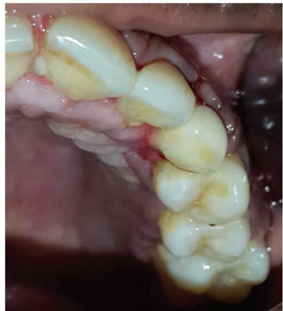
Fig 7 - 1 week Post operative