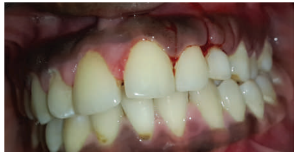
Fig 6 - Week Post operative