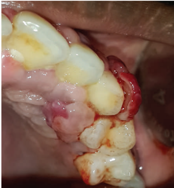
Fig 2- Preoperative view - occlusal

The biopsy results showed stratified squamous epithelium with underlying fibro vascular connective tissue. The epithelium exhibits long and thin rete ridges and is compressed and atrophic in some areas. The underlying connective tissue is covered in fibrino purulent membrane in some areas. The connective tissue also shows numerous budding capillaries and dense inflammatory cells predominantly of lymphocytes and plasma cells suggestive of Granuloma Gravidarum.