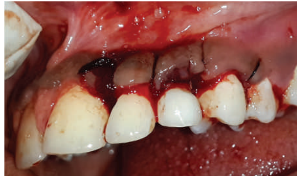
Fig 5 - Immediate Post op