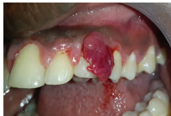
Fig 1- Pre operative view - Labial

Local Anaesthesia was administered by Local infiltration Labially and palatally, and excision was carried out by diode LASER Flap was elevated to gain access to the peduncle and it was removed along with the underlying granulation tissue. The area was debrided of local irritants and sutured using 3-0 black silk with interrupted sutures. A periodontal pack was placed to augment healing.